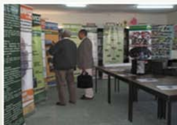
A Photo Exhibition