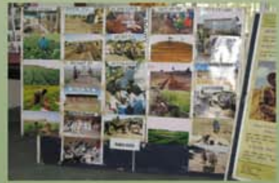
Some pictures from the Exhibition