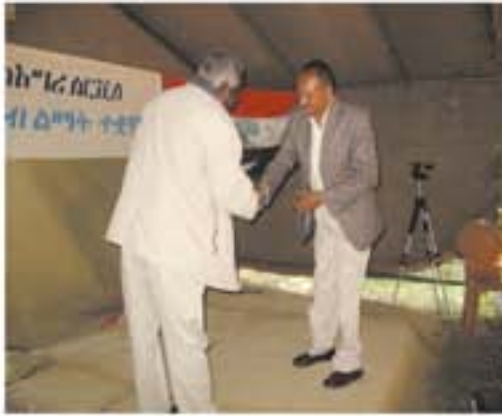
Award of Certificates