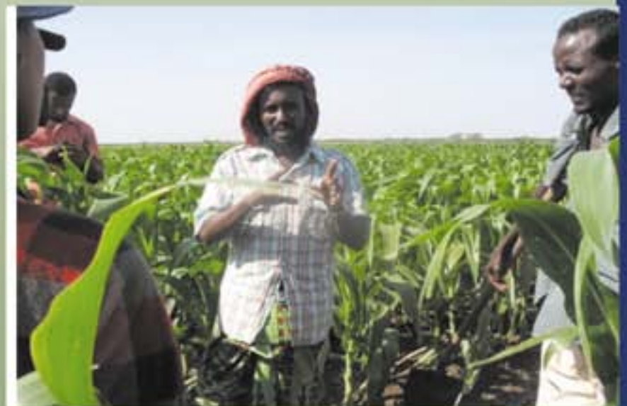
Surface water harvesting structure (pond) and maize crop at Alidege kebele