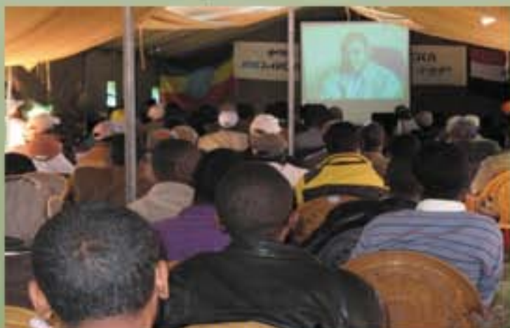
A video show

There was also a presentation on the experience of ASE on community managed cattle breed improvement through the introduction of exotic breed (bull service) by a consultant, the consultant who assessed the impact.